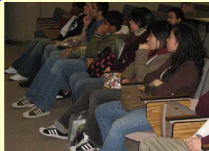
Students listen in on a motivational workshop presented by one of our alumni at PCED 2007