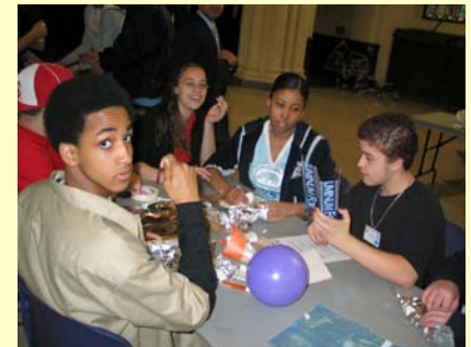
Students prepare vehicle for the "Flotation Competition" team project