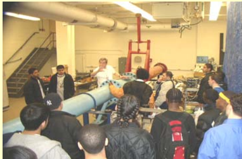
Students visit the Mechanical Engineering Aerodynamics Lab during the lab tours session